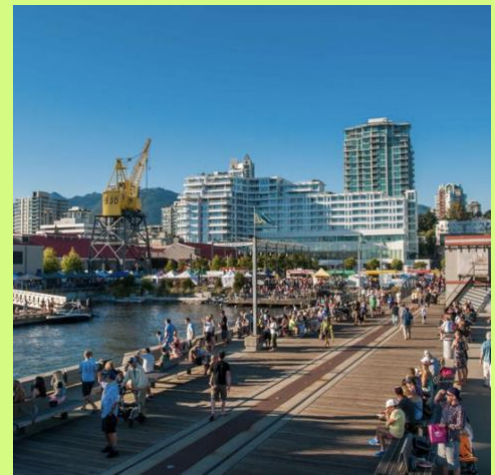
The Shipyards District