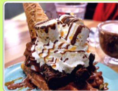
Quay Market & Food Hall

Farhan has extensive expertise in dental consulting across a wide spectrum of employers, PPOs, HMOs and TPAs. He brings to CADC over 2 decades in dental consulting. You can email him here