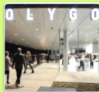
The Polygon Gallery