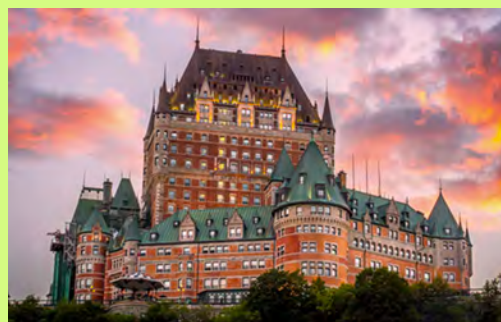
Walking Tours of Old Montreal